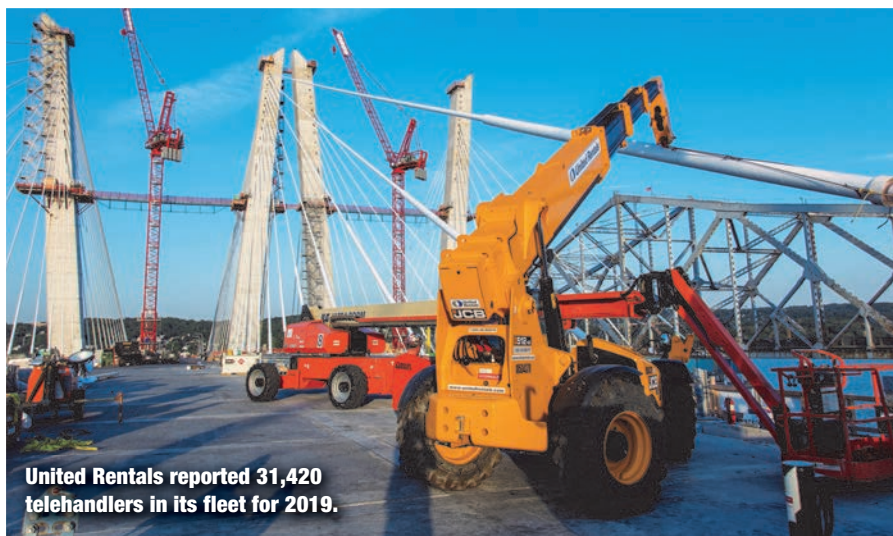
United Rentals reported 31,420 telehandlers in its fleet for 2019.

United reaffirmed its full-year outlook, with total revenue for 2019 expected to be between $9.15 and $9.55 billion. Capital expenditure is